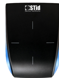
80 mm / 3.15"