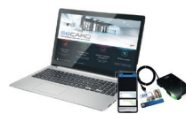
SECard configuration kit, SSCP® v1 & v2 and OSDP™ protocols