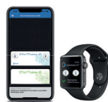
NFC smartphones / smartwatches using STid Mobile ID® application