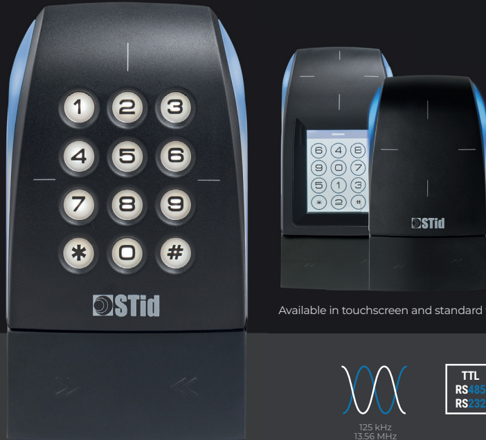
Available in touchscreen and standard versions

125 kHz CARDS, MIFARE® DESFIRE® EV2 & EV3 AND NFC SMARTPHONES